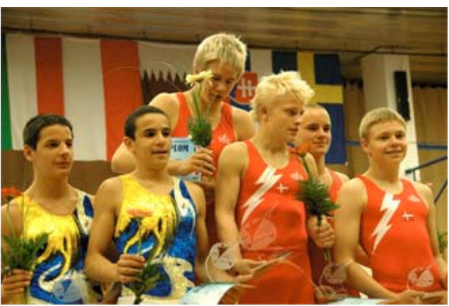
More Friendship Cups' photos on <a href="http://trampoliny.cstv.cz">http://trampoliny.cstv.cz</a>